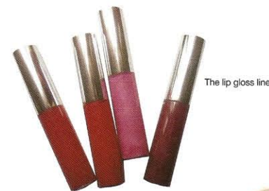
The lip gloss line

● Examine any all-natural claims. As yet no regulatory board has set down standards for manufacturers' claims that their products are all-natural or all-mineral. To be sure, read product labels. Theresa Carbonel, who formulates the makeup mixes at Ellana, advises staying away from products with parabens and formaldehyde. HT